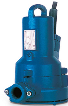
Submersible grinder pumps with shredding action provide reliable and economical discharge of effluent under pressure in private municipal and communal schemes

The volume of sewage remaining in the pipeline per meter, when the pump is not running, is also much lower, at 34% of the four inch equivalent line. This in turn considerably reduces the possibility of septicity. Studies have also shown that pressure sewers can be up to 50% cheaper than equivalent gravity lines. Since the line is closed, there is no infiltration or excess inflow caused by broken pipes or leaky joints, which can potentially result in a reduction of inflow to the treatment plant.