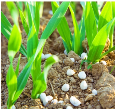
Petrochemicals and fertilizers