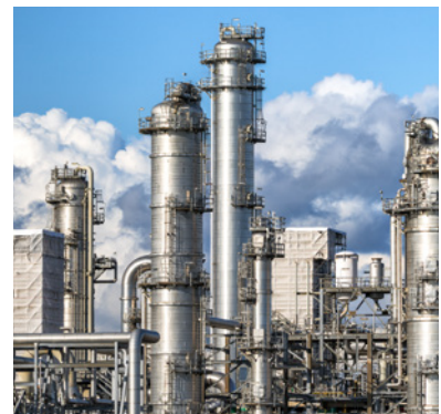
Downstream oil and gas