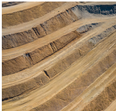
Mining and metals