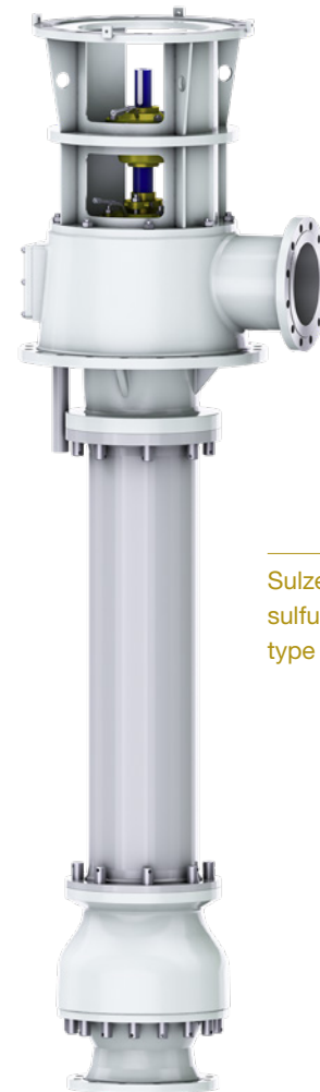
Sulzer's vertical sulfuric acid pump type VAS