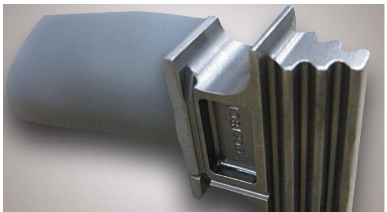
Finished frame 5, first stage bucket

Porosity and oxide content of STSH H16 is less than 3% in combination. Coating roughness typically measures between 15-300 microinches Ra (.100 cutoff) before possible post-coating processing to improve finish. The bond strength of H1Coat H16 is greater than 10'000 psi (ASTM C633).