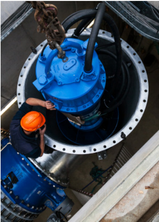
Installation of a vertical submersible propeller pump from Sulzer in a steel riser pipe in size DN 1600

For the second construction phase, the 700 kW pumps will be reduced in flow by variable frequency drives to 5,200 l/s as well. The tender requests a discharge head of 3.92 up to 9.0 meter. Combined with a service contract the end customer was granted a warranty period of five years for the new pumps.