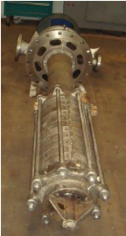
The vertical can pump after the retrofit