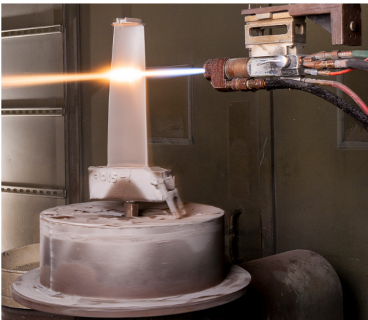
Figure 1: HVOF MCrAlY application

Examples of components which can benefit from this application include turbine nozzles, vane segments, and turbine blades/buckets.