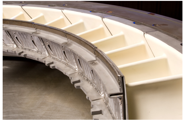
P23 TBC applied to full gas path of nozzle segment