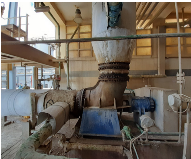
Evaporator circulation pump type CAHRM750K running at site (2020).