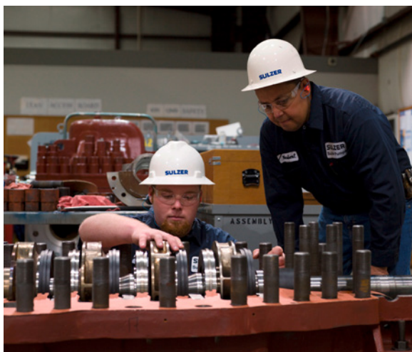
Picture 3: Retrofits offer the opportunity to upgrade components and improve reliability