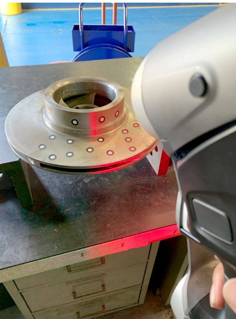
Picture 2: A typical example of a Sulzer service center 3D scanning a Brand X component