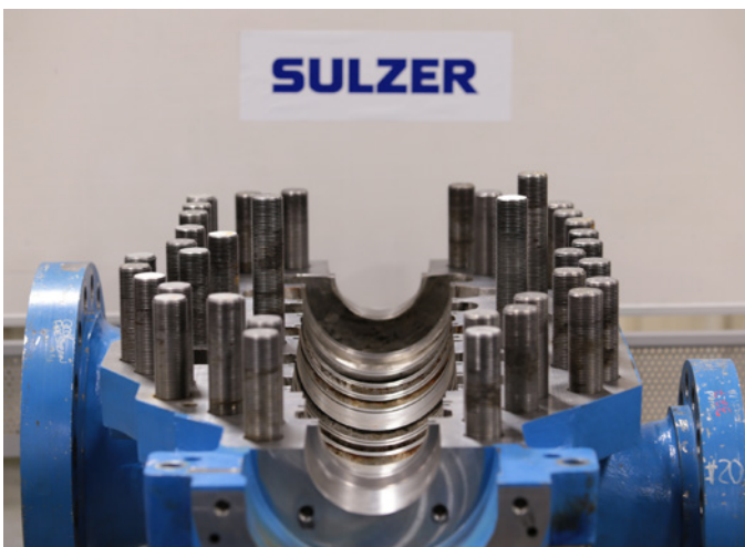
Picture 4: Sulzer offers in-house machining, retrofits and reverse engineering capabilities

The ability to improve efficiency and reduce energy consumption through modern engineering also offers the opportunity to reduce the environmental footprint of the business. As more pressure is placed on industrial plants to improve the environmental impact of their operations, so the retrofit project has the potential to deliver both a cost and CO 2 emission reduction.