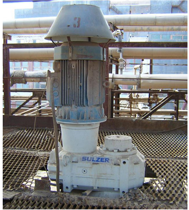
SALOMIX LV-11/71 agitator

The SALOMIX LV agitator is well suited for storage applications. A good agitation with a vertical flow provides correct agitation intensity that fulfills the process requirements for good mixing and keeps the solids in suspension. The agitator operates smoothly with low vibrations. It is of reliable design with a sturdy shaft and a strong gearbox. The correct material of construction withstands the particular chemical composition at the site. The paddle is fixed on the hollow shaft with a reliable system, and the position of the paddle is adjustable axially. The agitator is easy to assemble, and the general agitator design provides low power consumption, decreasing the customer's operating costs.