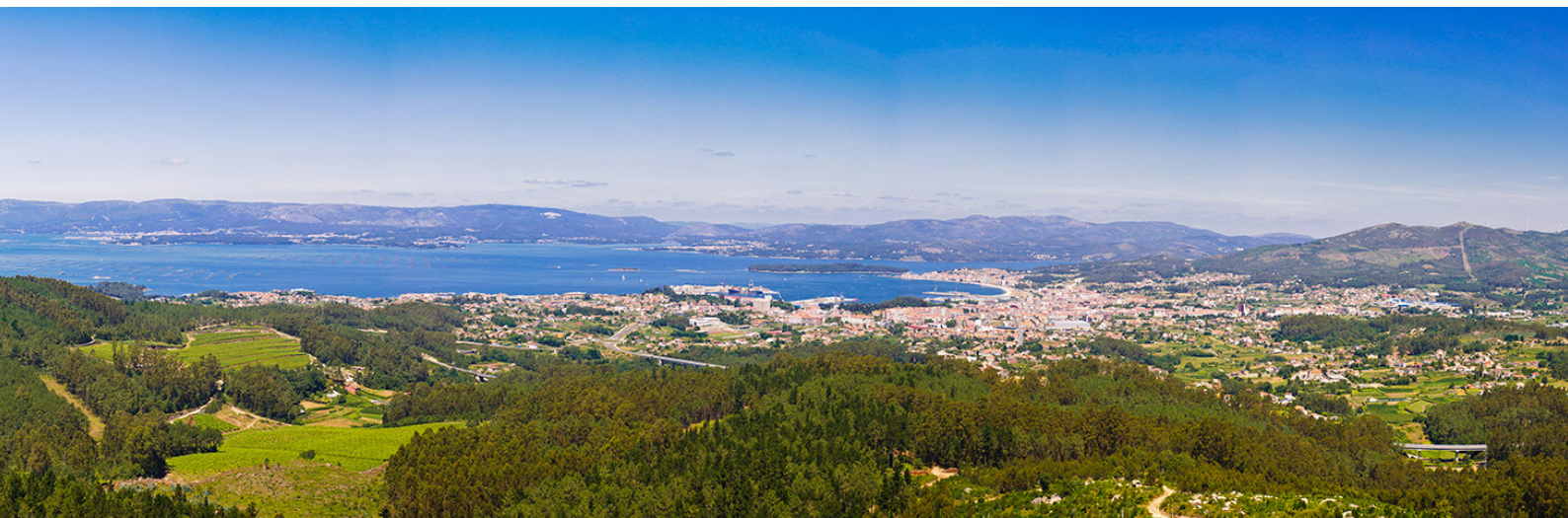
Sulzer engineers provide maintenance and operational support to maximize the performance and reliability of Vilagarcía de Arousa's network.

As part of this project, at least 10 pumps have been moved to different stations, enabling the performance of these sites to be optimized at the earliest opportunity. In addition, more than 20 pumps have been specified in such a way that they are interchangeable between several pumping stations.