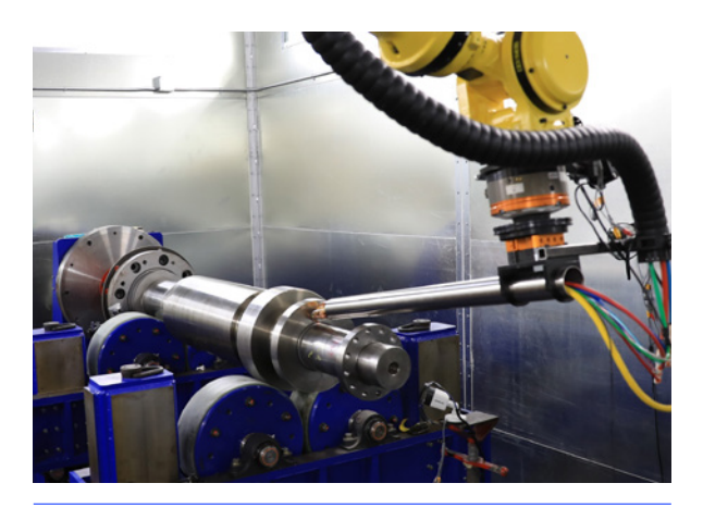
To ensure a uniformity, an automated application system is required

Laser metal deposition is a technique that can be selected for the repair of many components used in rotating equipment and is similar to methods such as conventional welding and HVOF. The range of repairs that can be achieved using LMD is extensive. From restoring worn bearing journals and seal areas to renewing the leading edges of steam turbine blades and the impeller vane tips of pumps.