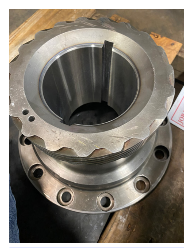
After final machining parts can be quickly returned to operation

The options for the impeller were to either repair it or to replace it with a new component, but the latter option would have a longer lead time. In parallel, Equinor and Sulzer had been in discussion about additive manufacturing (AM) technologies and this naturally lead on to a request to repair the impeller using AM, rather than waiting for a replacement to be manufactured.