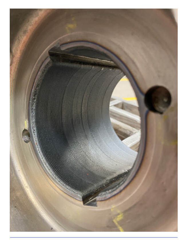
Considerable metallurgical knowledge is required to deliver high-quality bond with the base material

Tests carried out as part of the qualification for Super Duplex included 10 measurements at three locations