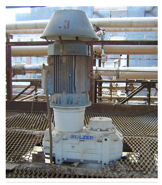
SALOMIX LV-11/71 agitator

The SALOMIX LV agitator is well suited for storage applications. A good agitation with a vertical flow provides correct agitation intensity that fulfills the process requirements for good mixing and keeps the solids in suspension. The agitator operates smoothly with low vibrations. It is of reliable design with a sturdy shaft and a strong gearbox. The correct material of construction withstands the particular chemical composition at the site. The paddle is fixed on the hollow shaft with a reliable system, and the position of the paddle is adjustable axially. The agitator is easy to assemble, and the general agitator design provides low power consumption, decreasing the customer's operating costs.