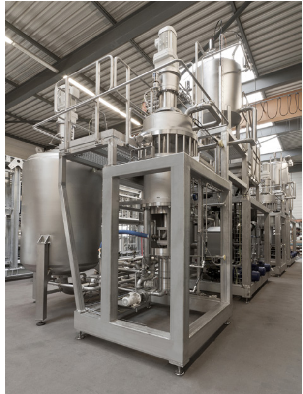
Commercial freeze concentration plant